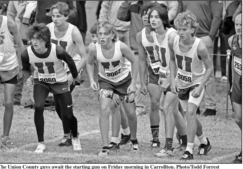
The Union County guys await the starting gun on Friday morning in Carrollton.