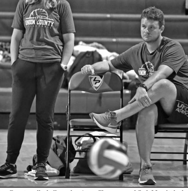
Pace Academy.

NGN: Speaking of the Area, it does seem like several