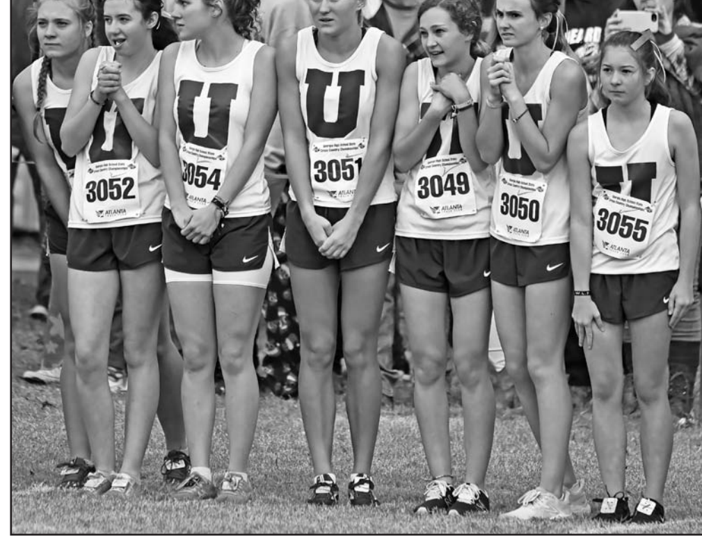
The Union County girls wait at the starting line on a nippy morning in Carrollton. The two Class AA races were the first of 16 State races over the weekend, beginning at 9 a.m. Friday morning. place Bremen had 247.

Vidalia came in fifth with 187 points, while ninth place-