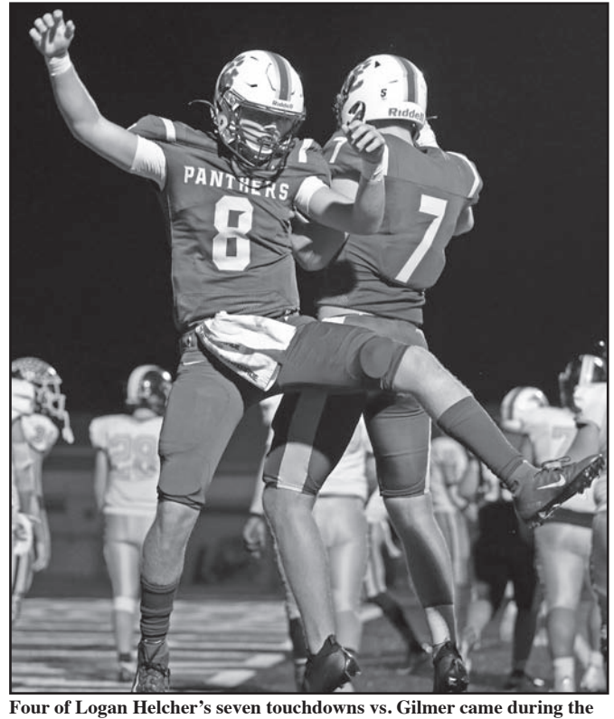
fourth quarter and overtime.

Rogers turned a careerhigh 168 yards rushing and caught five passes for 34 yards